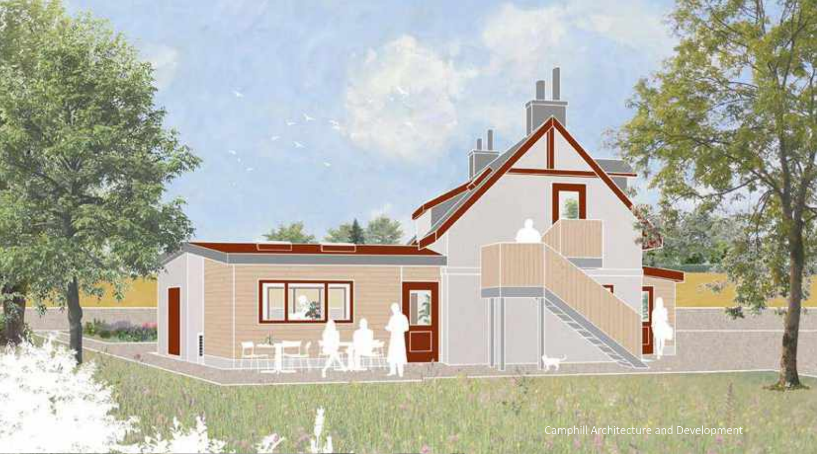
Camphill Architecture and Development